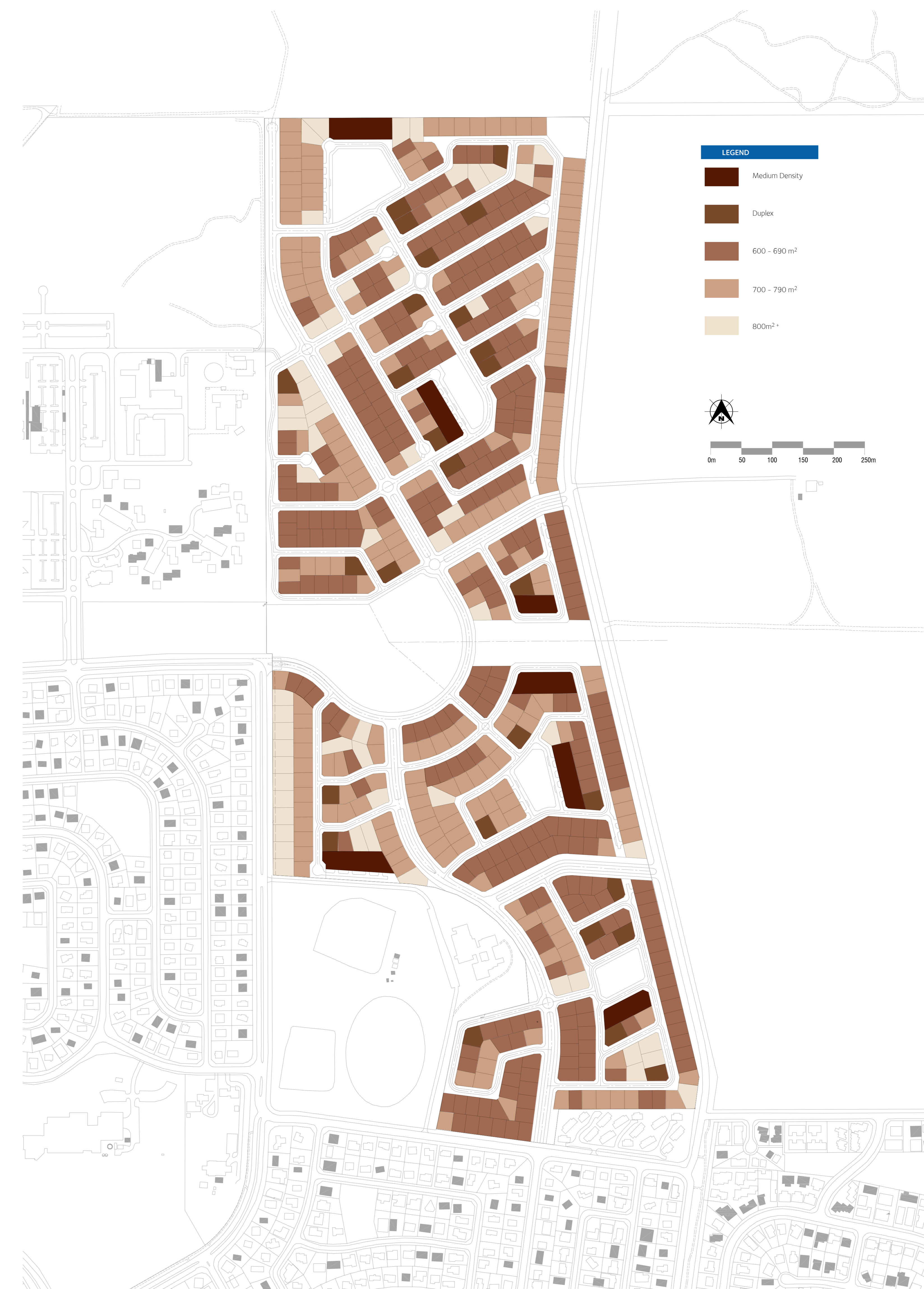
INDICATIVE LOT DISTRIBUTION PLAN